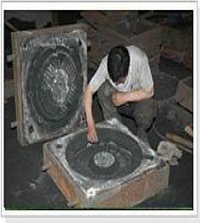
Fig. 3: A metal caster inspecting a sand mould

Foundries also employ sodium bentonite to clear impurities from melted metals before pouring them. A typical casting sand mould which is being inspected by a metal caster is shown in Figure 3.