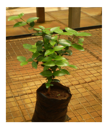
Figure 1: One of the seedlings growing in the greenhouse