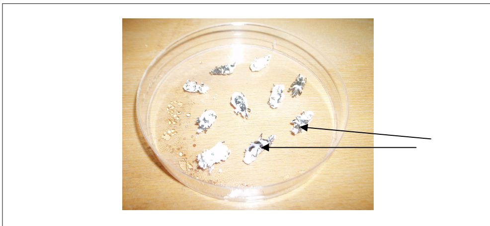
Plate 1: Adult C. sordidus infected with B. bassiana . Notice fungal growth at intersegmental junctions (arrows)

Incubation of the dead weevils in humidified chambers resulted in development of mycelia on the surface of the cadaver, starting from the intersegmental junctions of the body and legs (Figure 2). No fungi grew on dead weevils in the controls since they died due to other causes apart from the fungus.