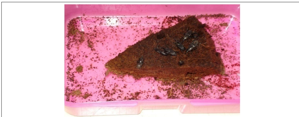
Figure 1: Banana weevils infected with Beauveria bassiana and introduced into plastic containers with banana corm.

Weevils were inoculated by dipping them into 20 ml fungal suspension with a conidia concentration of 10^8 conidia \text{ml}^{-1} for 11 seconds. The suspension was then drained off and weevils were transferred to plastic containers. Banana corms were then placed in the plastic containers as food for the weevils and placed in the laboratory in a dark room. Control weevils used as a check were dipped in sterile distilled water containing 0.01% Tween 20. Mortality of the weevils was recorded every 3days for 40 days. The experiment consisted of five replicates for ICIPE 279, M573, ICIPE 273 and KE300, and four replicates for ICIPE 50, M470, M207, M618, M221 and M313.