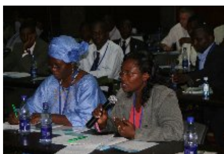
Participants follow proceedings and make contributions during plenary sessions